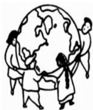
Hand in Hand

In the past few months two important e__1__ have taken place in the world. The war on Iraq m__2__ thousands of people lose their homes. How people all over the world w__3__ they could live a peaceful(和平的) life! Many people died of SARS. It's e__4__ duty to make a contribution t__5__ fighting SARS. We all believe i__6__ we work with one heart, world peace is c__7__ one day and science is able to win the war a__8__ SARS, just like the Chinese climbers who overcame(克服) d__9__ and finally r__10__ the top of Mount Qomolangma on May 21, 2003.